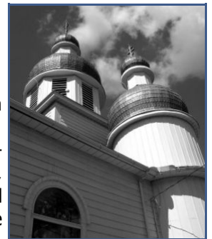
The domes of a Ukrainian Catholic parish in Simpson, PA

the five Eastern Catholic traditions: Byzantine, Chaldean, Alexandrian, Antiochene, and Armenian. A rite signifies more than a liturgy (though anyone who has attended a liturgy of the Eastern rite readily picks up on a great many differences); it denotes distinctive traditions across a broad front. Noteworthy among these for Eastern Catholics, in contrast with those of the Ro-