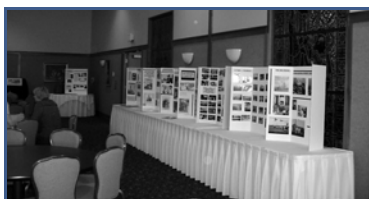
Regan Hall was decorated with memorabilia and many pictures illustrating the rich history of our parish.