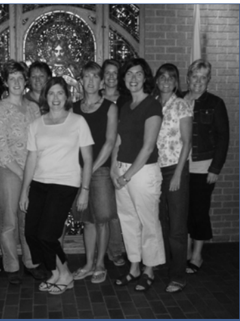
Members of M.O.M.S. in Sept. '06

nt de Paul about six months ouncement in the church bulletin I could connect to the parish, all, a way I could grow spiritu- group of some kind would keep I noticed the announcement, moms of small children. With group was meant for me.