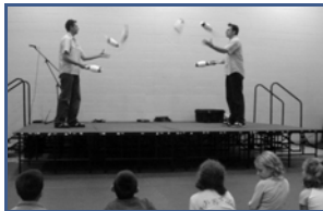
APEX Ministries brought their family-friendly show and Catholic message to St. Vincent's on Sept. 10, 2006.

Being a faithful adult disciple of Jesus Christ involves "consciously growing in the life of Christ through experience, reflection, prayer and study." This year we are continuing to offer Bible Studies, Book Club, Evangelization Initiative, Guest Speakers, Ministry of Mothers Sharing (MOMS) groups, and Natural Family Planning classes. Some new offerings this year are a DVD/discussion series on What Makes Us Catholic, a study group on Great