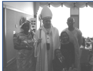
The Archbishop graciously greeted and posed for many pictures with parishioners at the reception in Regan Hall following the Mass.