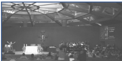
A large choir and group of instrumentalists led the assembly in joyful music at the Mass celebrated by the Archbishop on Sept. 24, 2006.